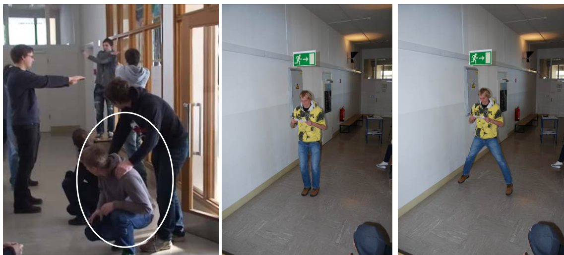
Figure 1: Left - action in the corridor - filtering the induced voltage pulse (encircled). Middle and right - two logical states of the RS-232 protocol presented by a student.

During the guided teaching of measuring ferromagnetic materials, they contrived a variety of representations of AC or DC currents (e.g. walking steadily along the wires for DC and spinning around for AC current), the resulting AC or DC magnetic flux (e.g. time synchronised steady walk along the ferromagnetic core for DC or rotating their hands for AC flux, with their hands raised for high flux amplitudes with a high permeability core or lowered for a low permeability core), the induced voltage shape (e.g. high jumps for the voltage impulse or twisted arms for AC induced voltage), etc.